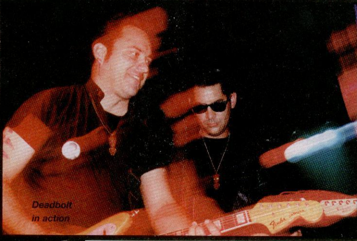
Deadbolt in action